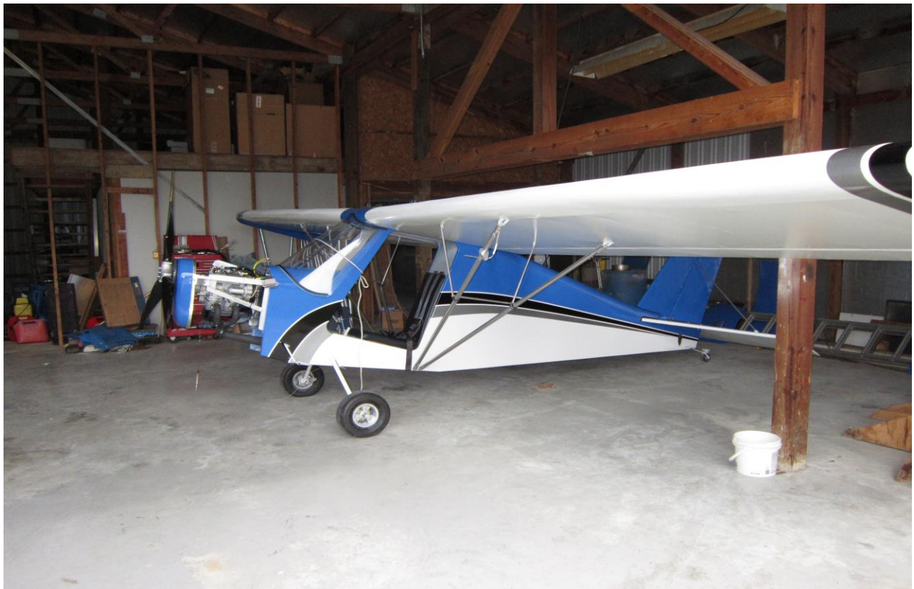
WINGS ON!! WHAT A PRETTY LITTLE PLANE. GOOD JOB GUYS & GAL.